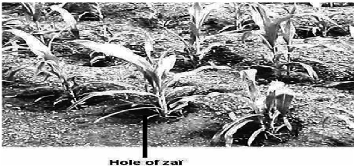
Figure 3. Zaï technique (Hole of zaï : sorghum plants are in the holes of the zaï).

with four replications in both experiments. The main plots were WMT and the sub-plots were FT. The treatments were applied to the same experimental units in each field in both years.